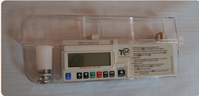
Fig. 4 Syringe pump mechanism for continuous medications (no syringe attached)

Continuous medication(s) refers to the giving of medications that enter the bloodstream slowly and continuously throughout the day. Continuous medication(s) are usually given via a syringe driver or pump, which is a portable, battery-operated machine (See figure 4).