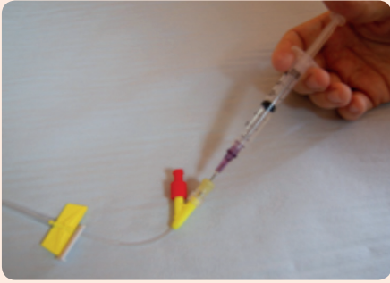
Fig. 6 Injecting using the blunt needle technique

For further instructions contact your healthcare team or refer to the step-by-step guides in your training pack.