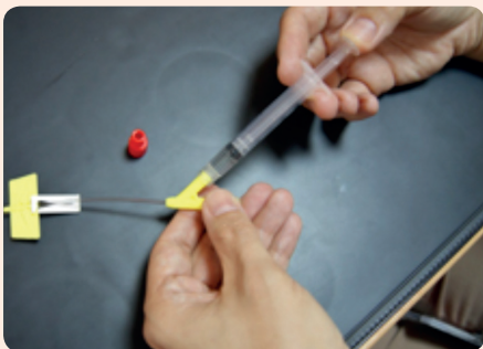
Fig. 5 Injecting using the no-needle technique

Firstly, remove the blunt drawing up needle from the syringe. Then give the injection by connecting the syringe to the port on the Y-arm using a twisting or screwing motion until the syringe is securely attached, as shown in figure 5. Then slowly push the plunger to give the medication. Once the medication has been given you can remove the syringe by unscrewing the syringe in the opposite direction.