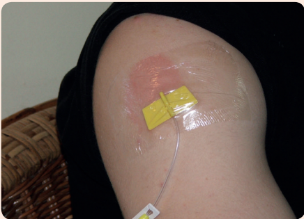
Fig 3. Redness at the cannula site

Caring for a cannula is quite easy. You will need to check the insertion site every time you give a no-needle injection using the cannula. If you notice that the cannula site is red, swollen, leaking or smelly, contact your healthcare team as it is likely the cannula will need to be changed (see figure 3).